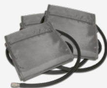
cuffs in size XS, S, M, L, XL

AMEDTEC Medizintechnik Aue GmbH Schneeberger Straße 5 · 08280 Aue · Germany Phone: +49 (0)3771 59 82 70 Fax: +49 (0)3771 59 82 790 info@amedtec.de · www.amedtec.de