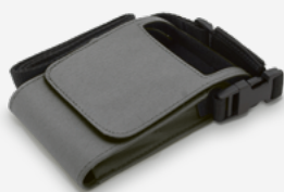
pouch for Holter-RR